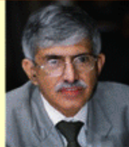
CEO, Madison PR

"Madison PR is the emerging new jewel in Madison World. Congratulations and keep your client's image up and you'll never look down!"